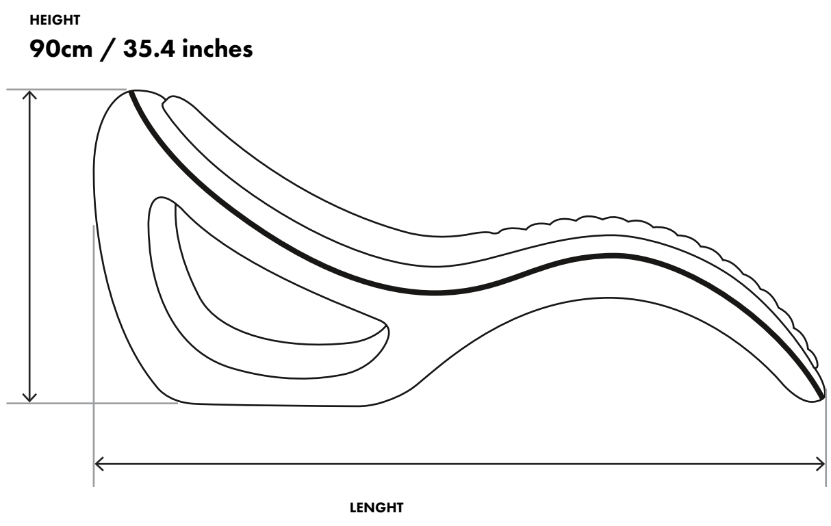
200cm / 78.7 inches