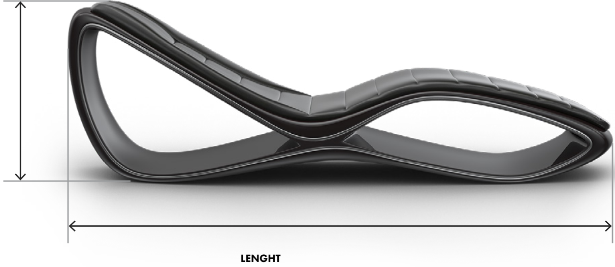
210,7cm / 82,95 inches